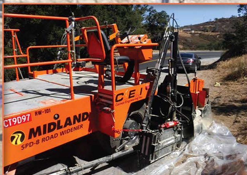
A Road Widener belonging to Calmex Engineering on Highway 78.