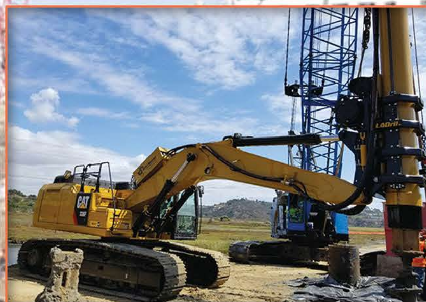
Tipco Engineering, Inc. operating a LoDrill on the North Coast Corridor.