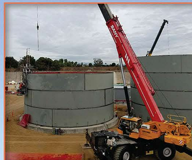
DN Tanks at the Carlsbad Energy Center building storage tanks.