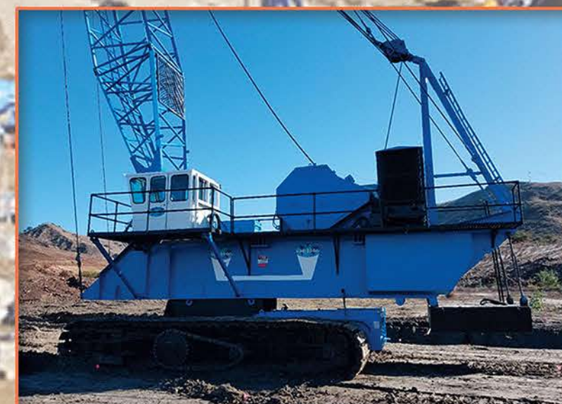
LDC 350/400 Dynamic Compactor at Camp Pendleton for Lampson International, LLC.